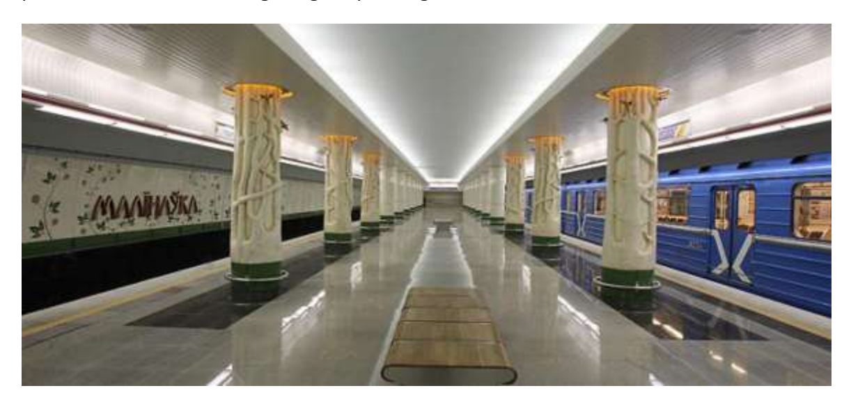
Buses and trams

For security purposes the Minsk metro uses metal detectors and scanners . Stations with heavy passenger traffic have dedicated personal examination areas where security personnel can examine large bags of passengers.