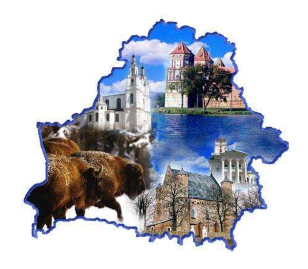
Training Course "Get Active Locally" 27<sup>th</sup> of August – 2<sup>rd</sup> of September 2018, Minsk, Belarus